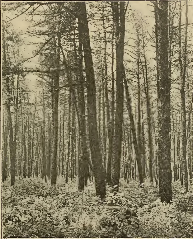
FIG. 8. Pitch pine forest; Farmington. The undergrowth is largely xerophytic, common shrubs being Ceanothus americana , Corylus americana , Myrica asplenifolia , Quercus ilicifolia and Rhus glabra .

The sand plains succession may be regarded as fairly representative of succession on unconsolidated rocks. It differs in some respects from succession on gravel and clay, but so far as the sequence and composition of stages is concerned the resemblances are greater than the differences. Just as was found in the